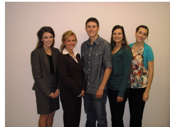
2013 Senior Division Contestants

3. Issues Response – Contestants will be provided with a recently published news article regarding the beef industry. Each contestant will be asked to compose a brief (250 words or less) response to the article. The responses will be judged by a panel of judges on the contestant's ability to respond to an industry article by thoughtfully answering questions, identifying misinformation and listing positive consumer information.